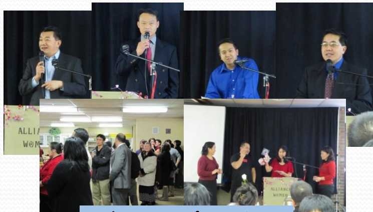
February - Valentine Event

Fellowship with a Hmong Alliance Woman Group in your region, and discover why they love Jesus so much and how they care for each other !!