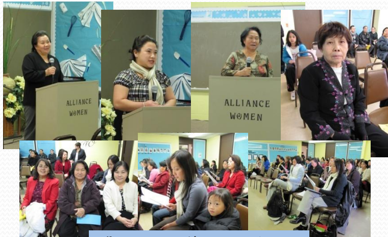
January - "Kick Off" Event

Fellowship with a Hmong Alliance Woman Group in your region, and discover why they love Jesus so much and how they care for each other !!